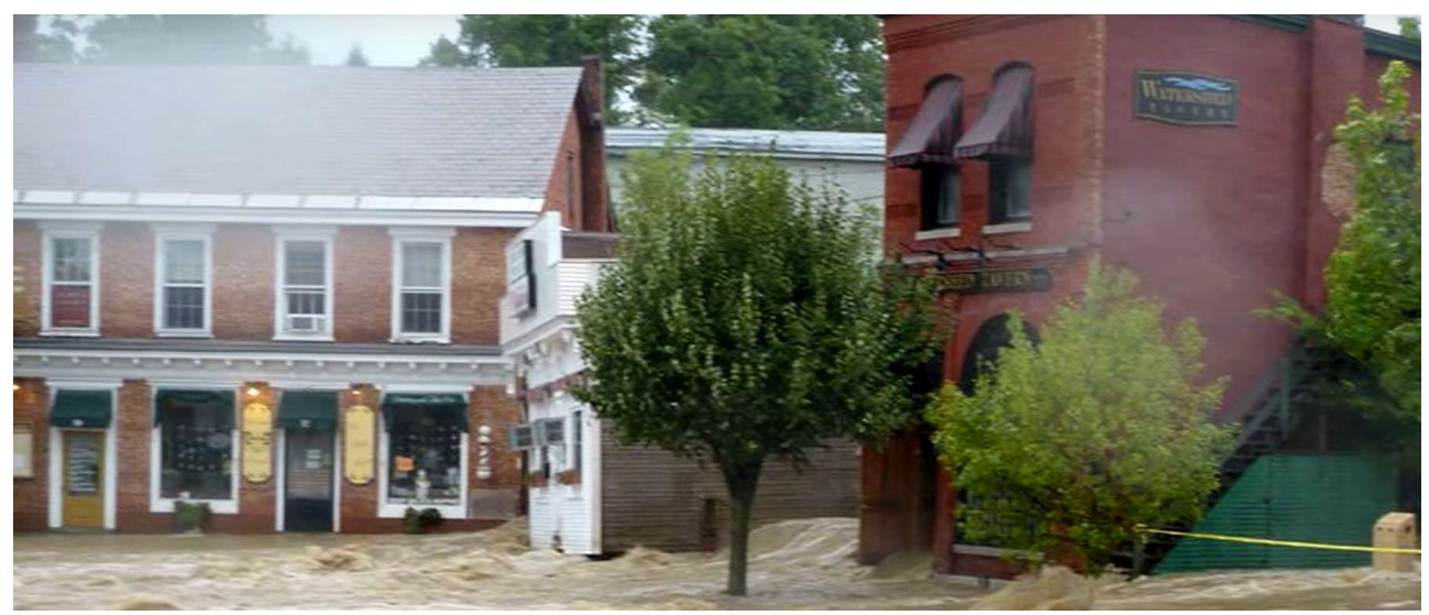
Waters of the Neshobe River swelled beyond the river banks and flowed through downtown Brandon, Vermont, during Tropical Storm Irene in 2011.

Following Tropical Storm Irene, when the Neshobe River swelled to jump its banks and flow through its downtown, the Town of Brandon, Vermont, partnered with certain landowners, and the Vermont River Conservancy to establish river corridor easements. River corridor easements involve the sale or donation of an easement on land adjacent to the river to preserve or restore areas identified as having a key role in the river's natural dynamic functions.